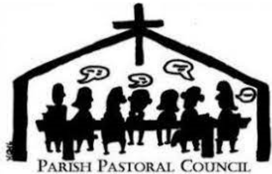
Our Parish Council Members for 2023 and their Positions

Next Meeting is January 18th starting with Mass @ 5:30PM